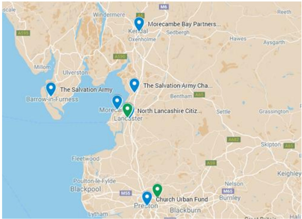
Figure 2: Map of charities in the Morecambe Bay area